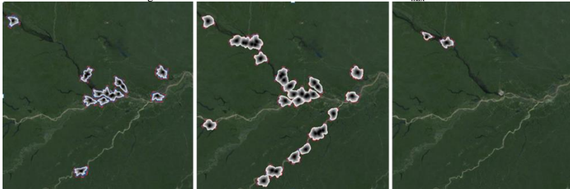
Figure 4: Results for the Guarita culture. Time intervals 1, 2 and 3 (from left to right). The red and blue colors are indicating the extended areas of influence due to different Dist_{max} values.

The quality of the resulting areas is highly dependent on the used cost surface. As [9] claimed, the data must be collected carefully to assure a more realistic model of the factors, which determine the area. That means, the final output is only as