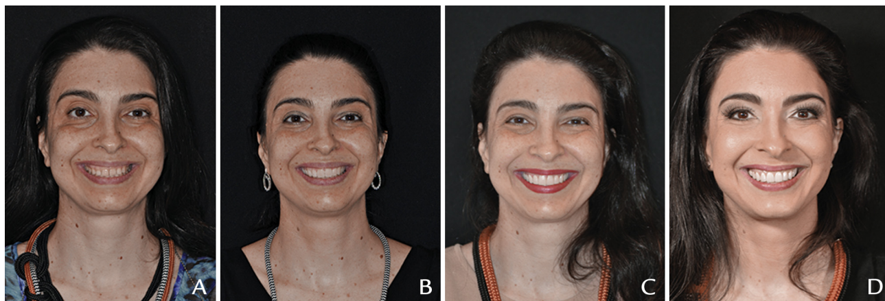
Figure 8. Comparative photography of different phases of clinical treatment with patient goals achieved. A, Initial smile. B, First evaluation. C, Evaluation guided by size, shape, alignment, and arrangement waxing. D, Result.

patient communication by standardizing and simplifying the procedures involved in oral rehabilitation. Dental selection performed before smile design optimizes dentofacial composition. The technique enables a systematic integration of the objective and subjective criteria 7 involved in esthetic rehabilitations, favoring the construction of a smile with personality and individuality.