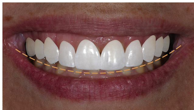
Figure 4. Third step: alignment. Align teeth according to horizontal lines, smile curve, and determine amount of tooth exposure.

Once the dental morphology and clinical treatment were approved, periodontal surgery was performed to increase the cervical margin by approximately 1.5 mm (Supplementary material, available online). After 1 month, home bleaching was performed with carbamide