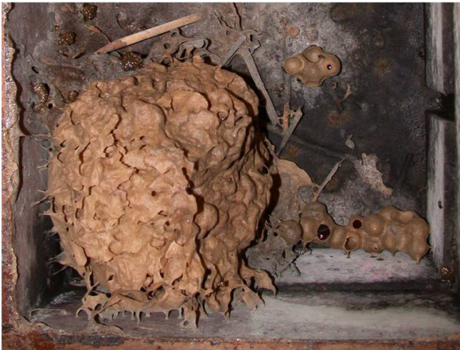
Fig. 2. Diapause phase: Plebeia emerina (Hymenoptera: Apidae: Meliponini) nest showing brood combs entirely covered by involucrum layers. Below right: some honey pots.

pause) (Blochtein et al., 2008) (Table 1). It is thought that in cold regions, such as southern Brazil, there could be a relationship between bee body size and their ability to withstand low temperatures (Blochtein et al., 2008).