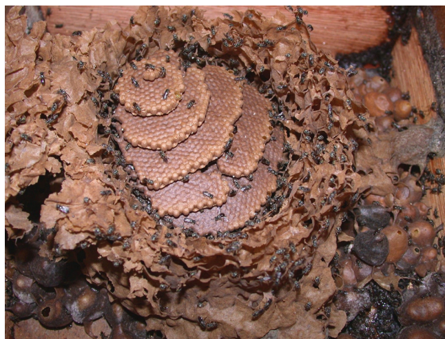
Fig. 1. Colony reproductive phase: Plebeia emerina (Hymenoptera: Apidae: Meliponini) nest showing many workers over brood combs, some brood cells being built in the periphery. Involucrum layers can already be seen around combs.

The addition of wax and propolis lamellae by stingless bees may be directly related to their need for facultative or obligatory reproductive diapause. It has also been suggested that their reduced ability to effectively thermoregulate their nests and their reproductive diapause may be related to body size (Blochtein et al., 2008). In stingless bee inhabiting southern Brazil, there is a progressive increase in worker size from Plebeia spp. (with obligatory diapause), through M. obscurior (with facultative diapause) to Melipona bicolor schencki Gribodo (with no di-