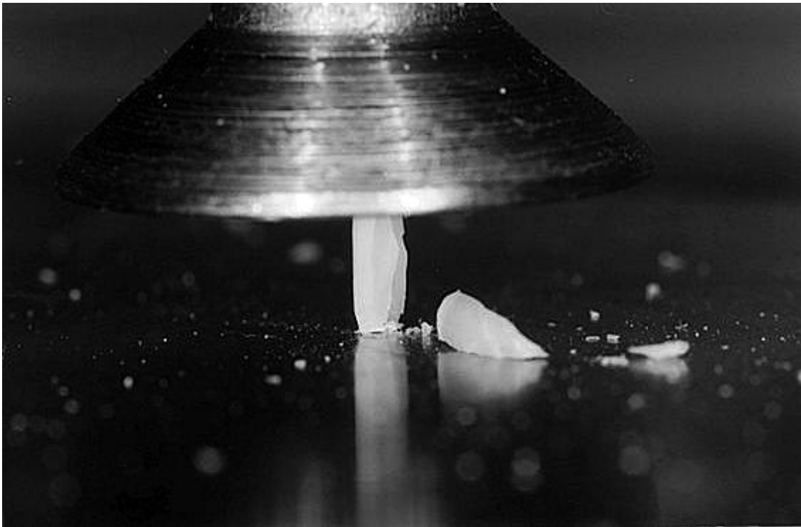
Fig. 1. Partial fracture pattern observed for belleGlass and Targis specimens

In relation to the fracture pattern, 100% of the belleGlass and Targis specimens had partial fracture mode. Solidex and Artglass specimens showed 100% of complete fracture mode (Figures 1 and 2).