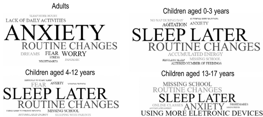
Figure 2 Tag-cloud with 10-most cited terms regarding participant's reason for altered sleep habits.