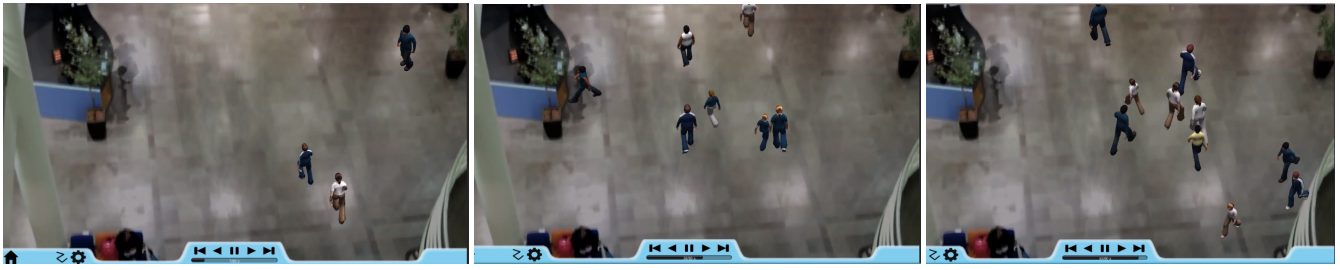
Figure 6: Simulations generated as a function of videos BR-02 and 3 values for K = 0.25, 0.5 and 0.75 .