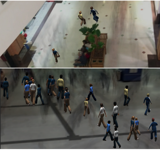
Figure 5: Simulations generated as a function of videos BR-07 (top) and UKN-02 (bottom).

shows some frames of an original sequence (on the top) and a simulated one (on the bottom). In such figure it is possible to note that the main trajectories are equivalent. In addition, the density of created agents can be adjusted using K value.