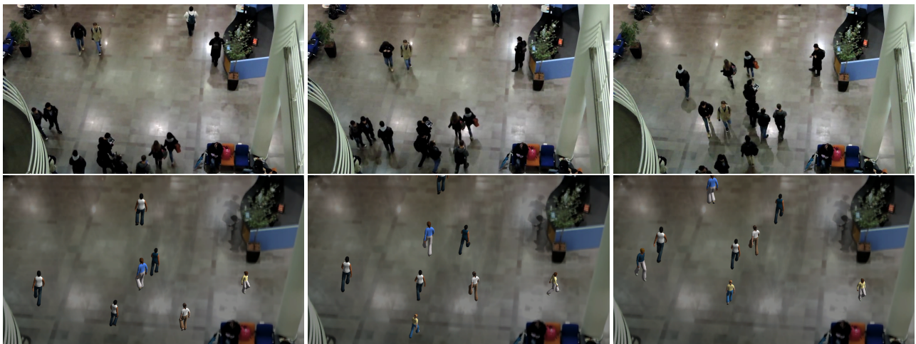
Figure 4: Original Video Sequence (on the top) and Simulation (on the bottom) based in video (BR-01).

This paper presented a method to continue videos for a certain time keep going agents in the scene and creating others, according to the observed motion patterns. Results showed the generated