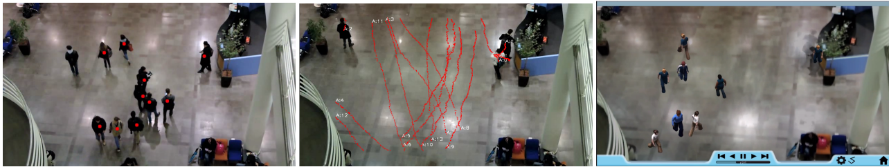
Figure 1: Overview of our method: on the left side real people trajectories are detected and tracked in a video sequence; in the center the trajectories are used to learn patterns of motion in our method, and on the right side our viewer illustrates population for a game, based on real life trajectories.

Virtual Human Simulation Laboratory – VHLab Pontifical Catholic University of Rio Grande do Sul, Brazil