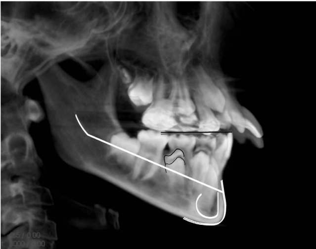
Figure 1. The anatomical reference line (ARL); superimposition of paired cone-beam computed tomography (CBCT) scans on the mandible's natural reference structures, described by Björk 10 ; and the occlusal plane line (OPL).

enlargement, distortion, and superimposition of anatomic structures. Despite the clear limitation for the use of cone-beam computed tomography (CBCT) in children, a retrospective study using CBCT to evaluate eruption rates and correlate them with the tooth's development stage could improve clinician's interpretation of the radiographic assessments, aiding on the decision-making process with regard to time of treatment. 2