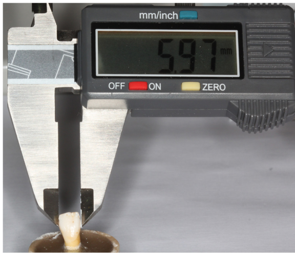
Figure 2 Initial measurement of the tooth.

The stripping procedure with PSD is presented in Figure 4 and the same sequence was performed with HS group but with use of handheld strippers.