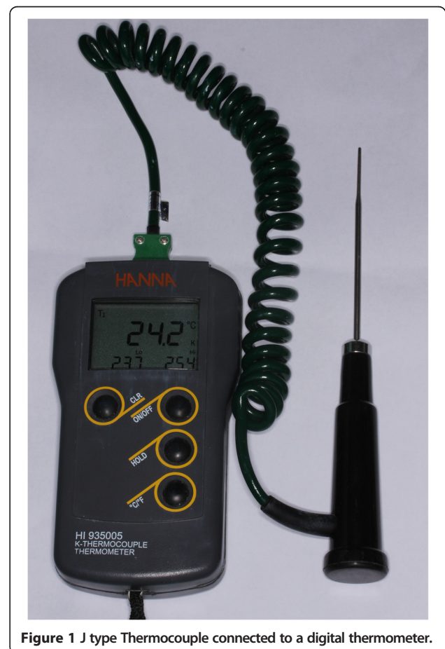
Figure 1 J type Thermocouple connected to a digital thermometer.

HS group: the stripping was performed using 6-mm metal handheld strippers (3812.8271, KG Sorensen, São Paulo, Brazil).