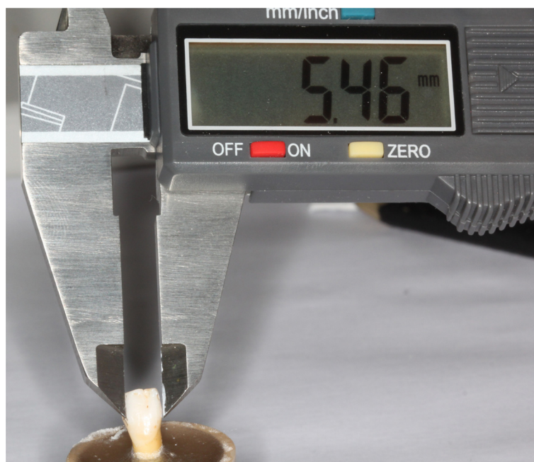
Figure 3 Definition of the amount of stripping.

The descriptive statistics for each experimental group is shown in Table 1. ANOVA and post hoc test showed that