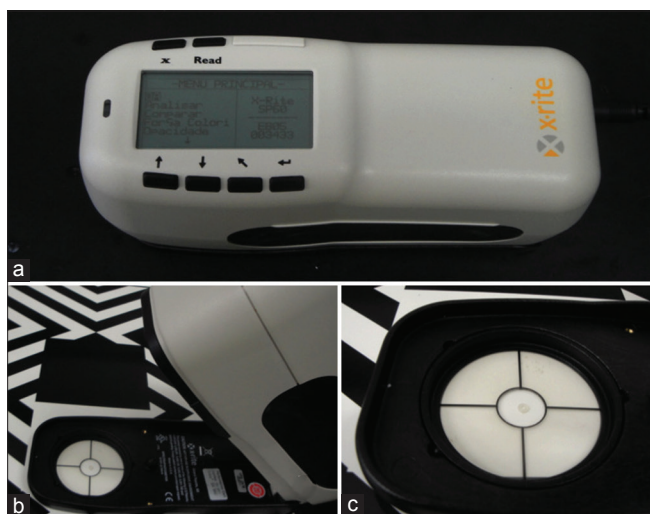
Figure 1: (a) Portable spectrophotometer (SP60 X-Rite, Grand Rapids, MI, USA); (b) Selection of a white background; (c) A sample of elastomeric ligature placed for color assessment

Data were analyzed with SPSS 20.0 software (IBM, Armonk, NY, USA). Intraobserver reproducibility was tested with intraclass correlation coefficient (ICC). The Shapiro-Wilk test attested that the data were not normally distributed for all dependent variables (L*, a*, b*, \Delta L , \Delta a , \Delta b , \Delta E_{ab} , and \Delta E_{2000} ). Variables L*, a*, and b* were compared between times (T1-T0) with Wilcoxon paired ranks; color changes ( \Delta L , \Delta a , \Delta b , \Delta E_{ab} , and \Delta E_{2000} ) were compared between groups (BP, C, WP,