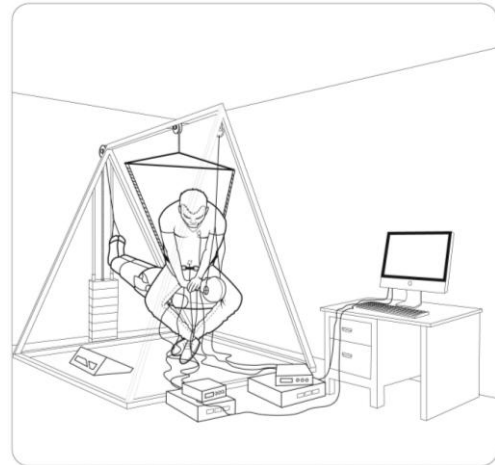
Figure 1. CPR during microgravity simulation (ER-Method) showing the body suspension device, the EMG system and the CPR manikin equipped with the system for measuring chest compressions.

A body suspension system built by the Microgravity Center - PUCRS was used to simulate hypoG (Mars – 3.7 \text{ m/s}^2 ) and microG ( 0 \text{ m/s}^2 ) [13]. This device consisted of a pyramidal structure with a suspended harness, similar to that used in skydiving, and a system of steel bar counterweights (CW, kg). The system of counterweights and the harness were connected via a steel cable to a pulley system. For microG simulation, the volunteer was fully suspended in the air in order to perform the CPR using the ER method (Figure 1).